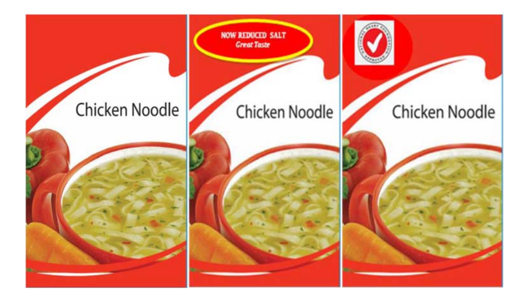
Fig. 2 (colour online) Packages (left, no health label; middle, reduced-salt label; right, tick label) that were shown to the participants prior to and during the tasting of the soups

the right amount of salt for me' and 9 = 'far too salty for me'. Expected and perceived liking were measured with a 9-point hedonic scale ranging from 1 = 'not liked at all' to 9 = 'extremely liked'. All sensory data were collected using CompuSense software version 5 (Compusense Inc., Guelph, ON, Canada).